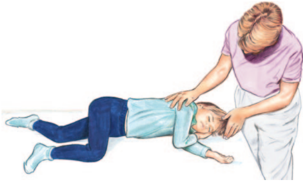
Figure 3. Recovery position.

In an infant, use a mouth-to-mouth-and-nose technique (LOE 7; Class IIb); in a child, use a mouth-to-mouth technique. 55