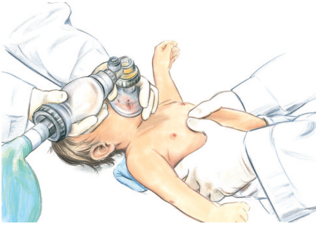
Figure 5. Two thumb-encircling hands chest compression in infant (2 rescuers).

5103,104 ; 6105,106 ). If you are alone or you cannot physically encircle the victim's chest, compress the chest with 2 fingers (as above). The 2 thumb-encircling hands technique is preferred because it produces higher coronary artery perfusion pressure, more consistently results in appropriate depth or force of compression, 105–108 and may generate higher systolic and diastolic pressures. 103,104,109,110