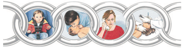
Figure 1. Pediatric Chain of Survival.

Appropriate restraints include properly installed, rear-facing infant seats for infants <20 pounds (<9 kg) and <1 year of age, child restraints for children 1 to 4 years of age, and booster seats with seat belts for children 4 to 7 years of age. 20 The lifesaving benefit of air bags for older children and adults far outweighs their risk. Most pediatric air bag–related fatalities occur when children <12 years of age are in the vehicle's front seat or are improperly restrained for their age. For additional information consult the website of the National Highway Traffic Safety Administration (NHTSA): http://www.nhtsa.gov