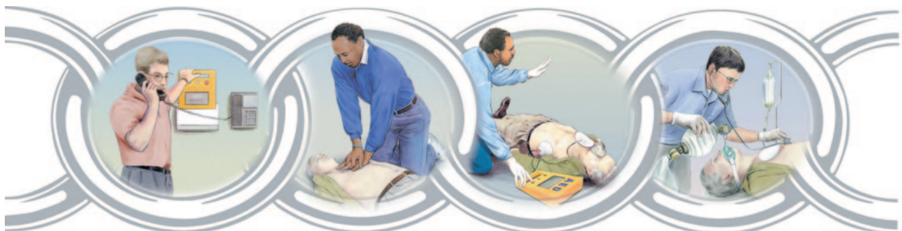
Figure 1. Adult Chain of Survival.

Stroke is the nation's No. 3 killer and a leading cause of severe, long-term disability. 61 Fibrinolytic therapy administered within the first hours of the onset of symptoms limits neurologic injury and improves outcome in selected patients with acute ischemic stroke. 76–78 The window of opportunity is extremely limited, however. Effective therapy requires early